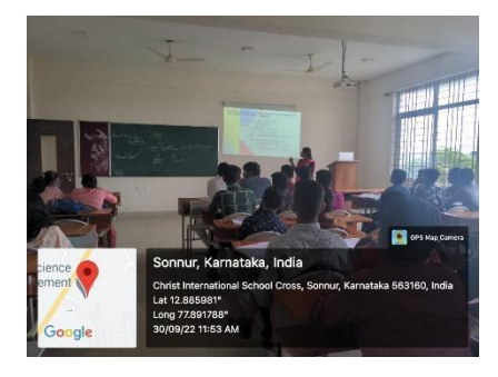
Annual Report on Expert Talk: Career Progression of Aviation Professionals – Opportunities and Challenges-29/9/2022